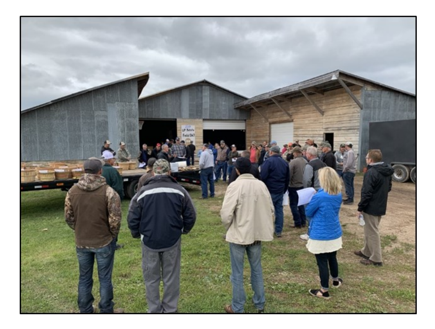
Figure 1. Participants at the 2019 U.P. Potato Field Day

On August 28, 2019 sixty-five potato growers, agribusiness representatives and others attended a field day at the U.P. trial location to view the plots and receive updates on topics important to the Michigan potato industry (Figure 1). 100% of those responding to an evaluation survey following the event indicated gaining new knowledge about potato production as a result of their participation. 60% of respondents reported intent to change some aspect of potato management on their farm as a result of the program, which they projected would impact approximately 2,690 acres with an average economic value of $50 per acre.